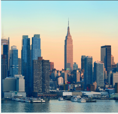
New York City / USA