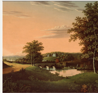
Bibury Village / England